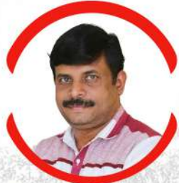
CA. Byju K Varied